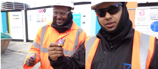
Traffic marshals receiving their Easter eggs

Easter bunny visited site in April and left some Easter eggs for all the site workers.