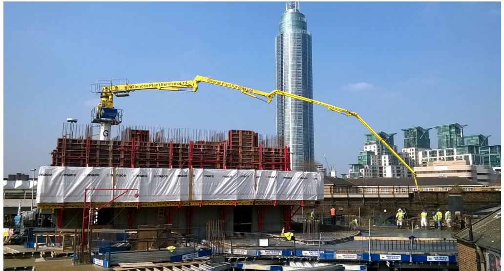
Pumping concrete to form a basement slab