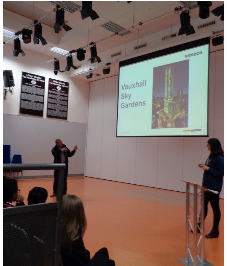
Mace staff presenting at the Lilian Baylis Technology School

The site team had their first CCS audit of 2015 earlier in April and achieved a 44/50 for their efforts, this means from the 5 categories the team achieve "excellent and exceptional" in all 5 categories.